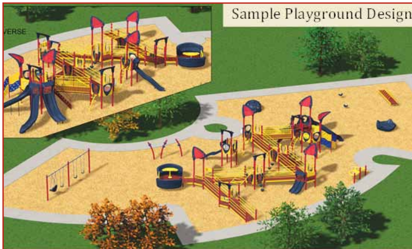
Sample Playground Design